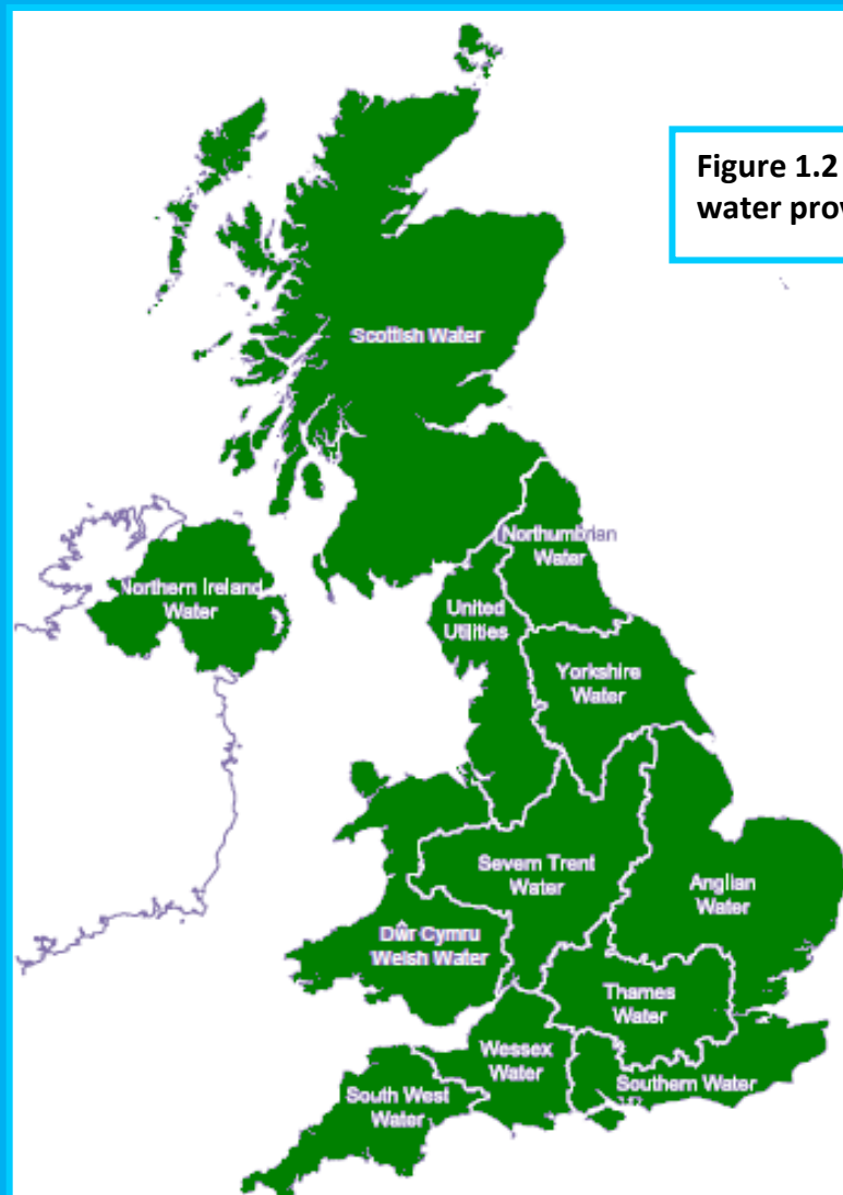
Figure 1.2 – map of the UK water providers/regulators

Your local water and sewerage company will assess and allocate your site into a 'band' based on size and water use, and charge for water leaving premises annually on this basis. One example of this is Zen Office Ltd; United Utilities (which serves the North West) deemed this site to be in band 6. By using techniques such as rainwater harvesting tanks, Zen Office could easily reduce their water consumption, thus fall into a lower band and save money, whilst helping to protect the environment and water supplies.